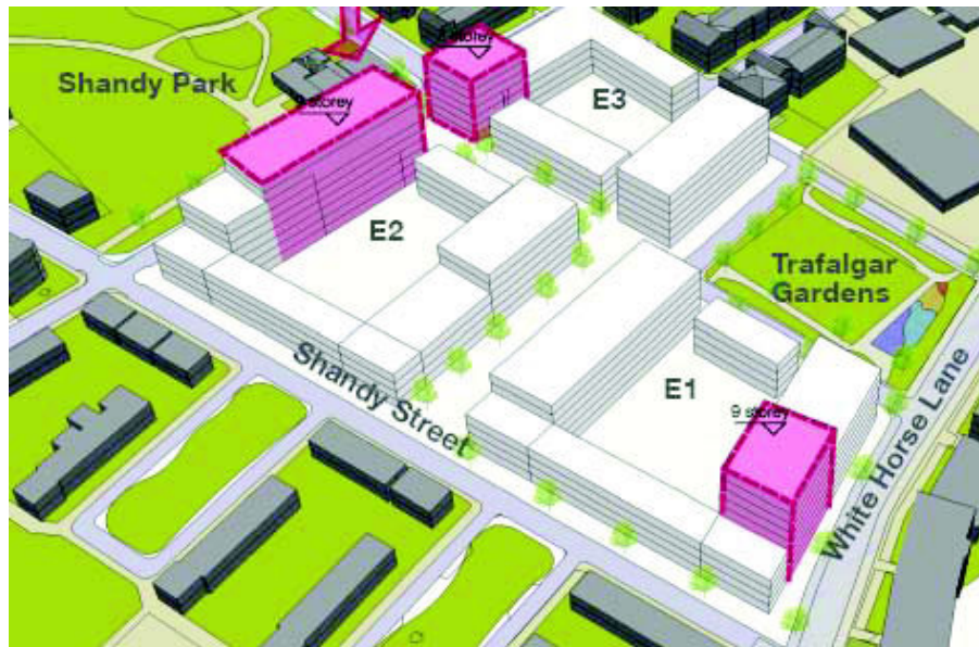
Figure 9.2 – Massing plan of Site E showing location of the higher rise elements