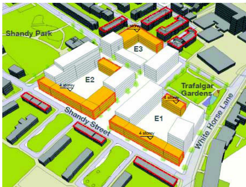
Figure 9.1 – Massing plan of Site E showing location of the lower rise elements